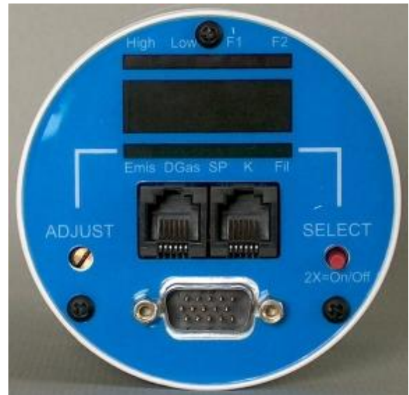
User Control Interface